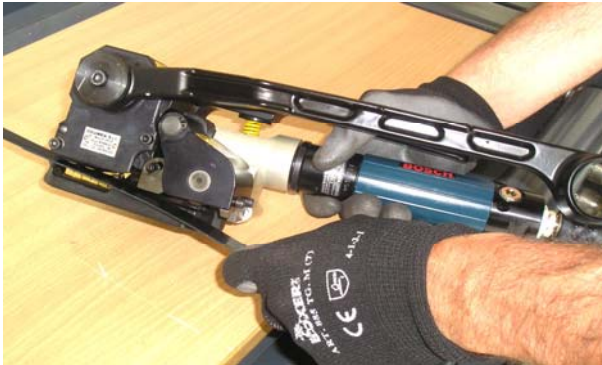
INSERT THE STRAP