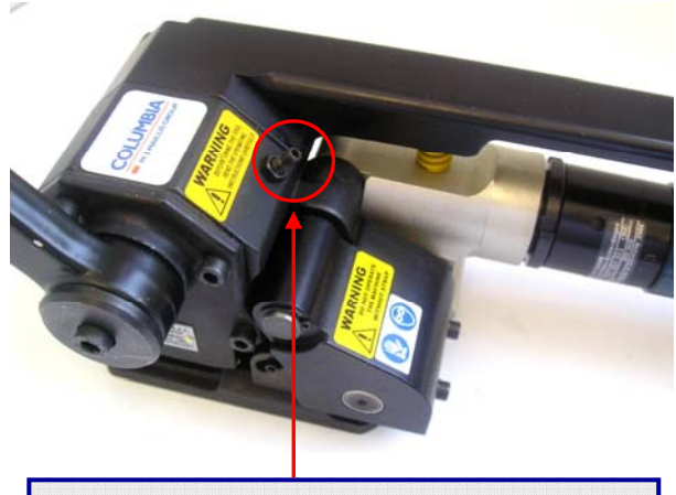
TURN THIS SCREW TO INCREASE OR DECREASE CUTTING AND SEALING